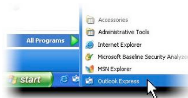
Opening Outlook Express from the Start menu

These first three steps are shown in the image below: