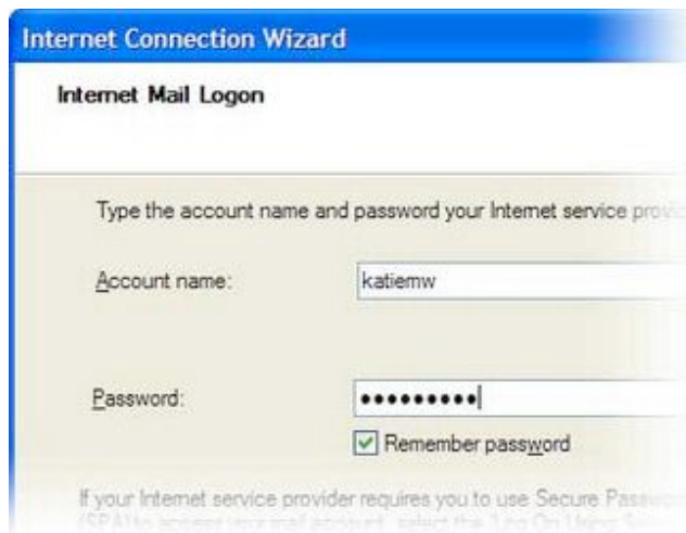
Internet Connection Wizard's Internet Mail Logon

Note: If you're concerned about break-ins to your e-mail, click to clear the check in the Remember Password box. You'll then be prompted for the password each time you send or retrieve mail.