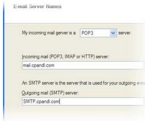
Internet Connection Wizard's E-mail Server Names

Note: If you chose HTTP as your incoming e-mail server—as for a Hotmail or MSN account—this wizard page changes slightly so you can identify your HTTP mail service provider.