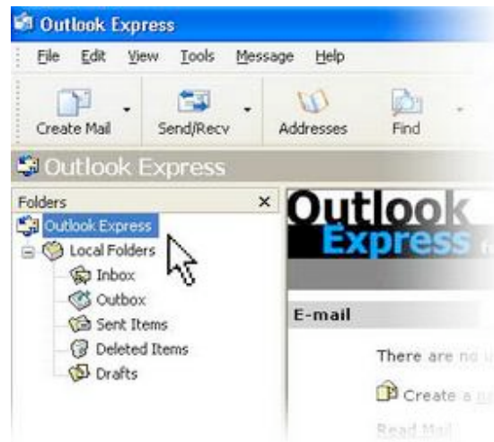
Outlook Express list of folders

If you don't see the list of folders and contacts on the left, click Layout on the View menu. Click Contacts and Folder List to check them, and then click OK .