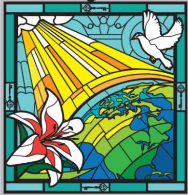
Protestant Women of the Chapel • Matthew 6:9-13 (NKJV)